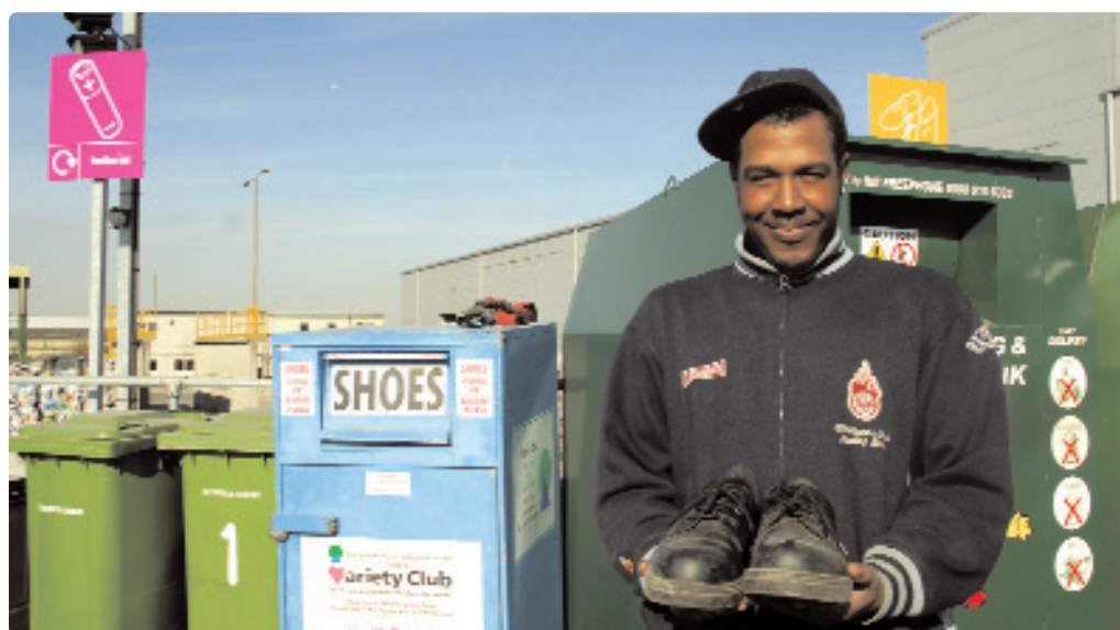
Eco-town proposals will be expected to demonstrate how they will move towards zero waste