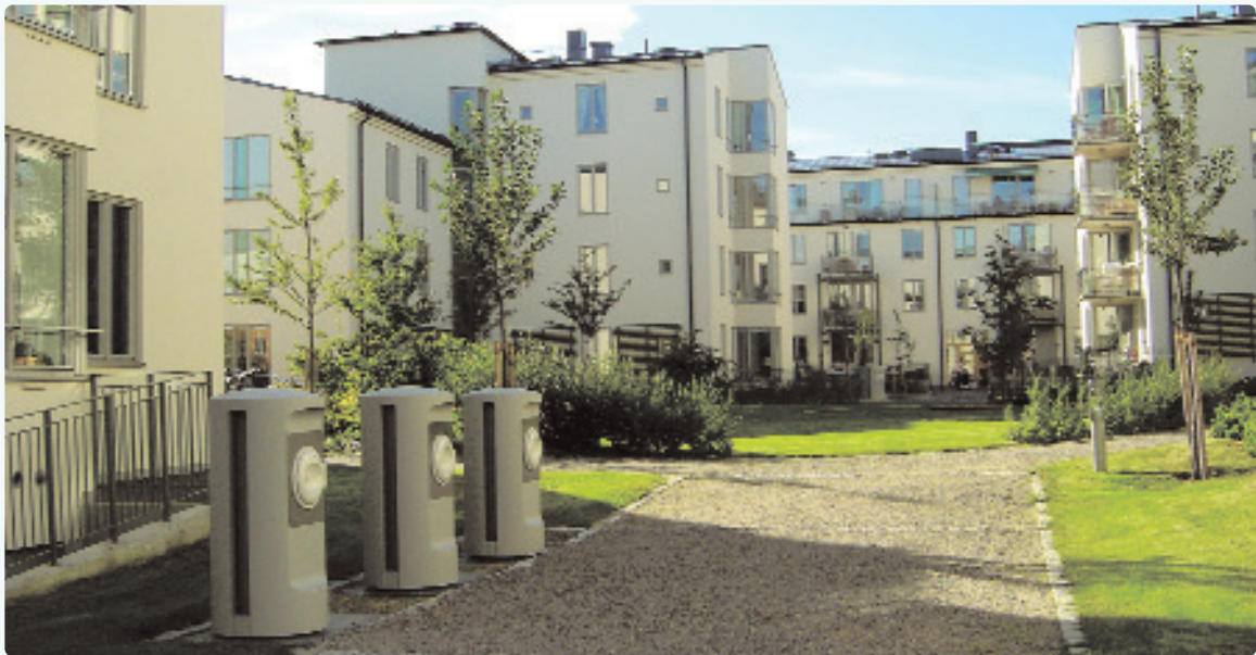
Vacuum-operated inlets to the underground waste collection system at Hammarby Sjöstad

Three waste management levels operate in Hammarby: building based, for separating waste at source and operated through vacuum-operated and centrally connected chutes to an underground waste collection system; block-based recycling rooms; and area-based hazardous waste collection points.