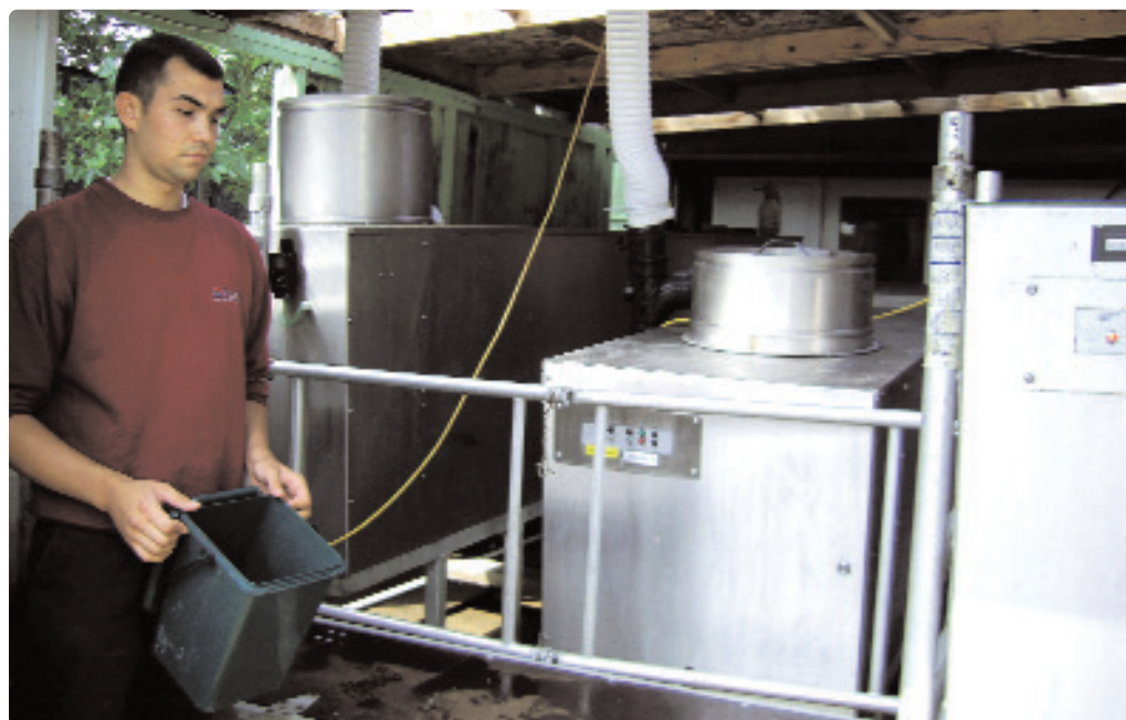
East London Community Recycling Partnership's local recycling initiative on the Nightingale Estate in Hackney serves 1,000 high-density homes collecting dry recyclables and biodegradable waste

Key points to note are the importance of source segregation and collection, the location of composting sites, their design, and the quality of output. Waste planners and developers must consider the availability of local land and relevant regulatory controls for any soil conditioner outputs when making investment decisions on