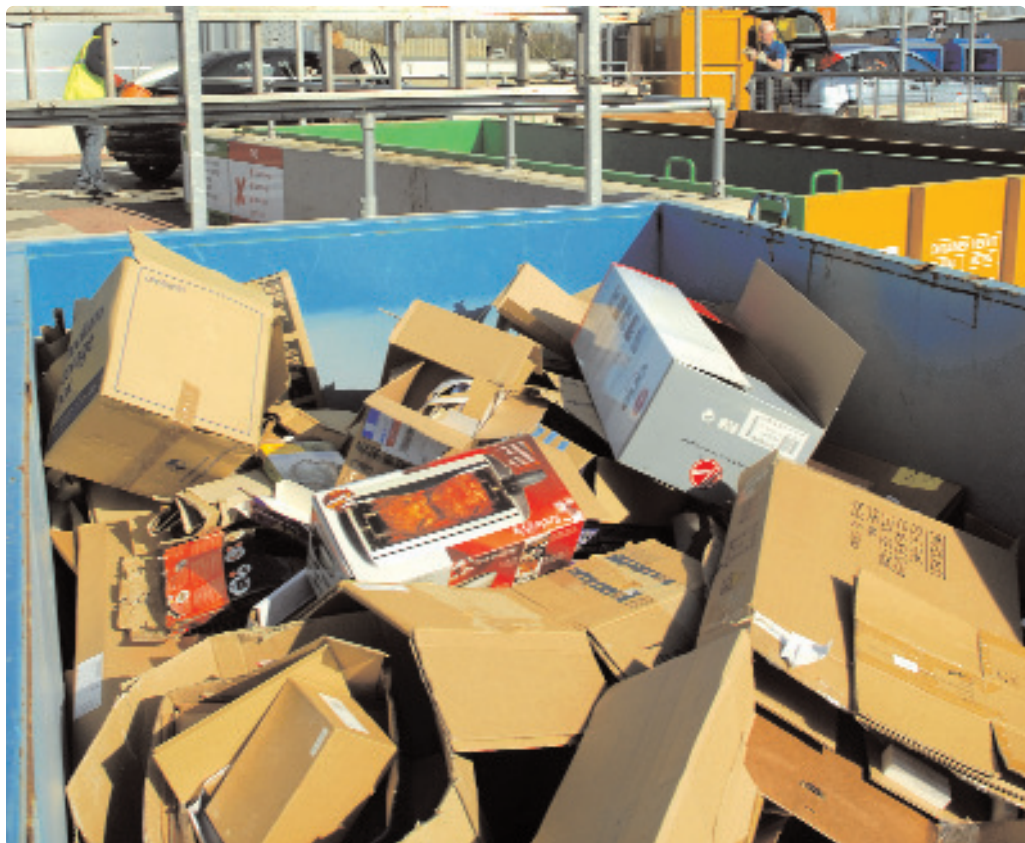
As exemplar developments, eco-towns should be leaders in the transformation from a waste management economy to one based on resource management

Suggestions are directed to those involved mainly at the masterplanning stage, with some further guidance provided on the construction and occupation phases.