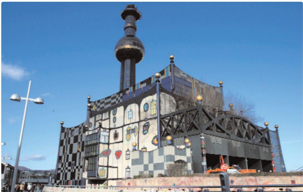
The Spittelau energy from waste and CHP facility in Vienna

Waste collection and disposal authorities work together to produce joint Municipal Waste Management Strategies (MWMSs). The MWMS should provide a clear framework for the management of municipal waste and waste from other sectors as appropriate. It should set out how authorities intend to optimise current service provision, provide a basis for any new systems or infrastructure that may be needed, and identify how the authorities intend to meet their obligations under the Landfill Allowance Trading Scheme. The MWMS is intended to act as an up-to-date, regularly reviewed route map for further investment required to achieve its targets. The MWMS sets the framework within which the authorities will let their waste collection and disposal contracts. It will also inform and be informed by any waste-related spatial plan. Guidance on MWMSs is available from Defra. 12 Some local authorities have developed zero waste strategies (for example Doncaster Metropolitan Borough Council 13 ) which may provide some ideas for eco-towns.